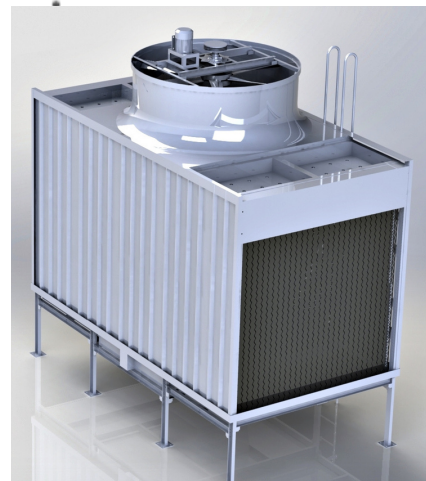
Cross Flow ARTX series